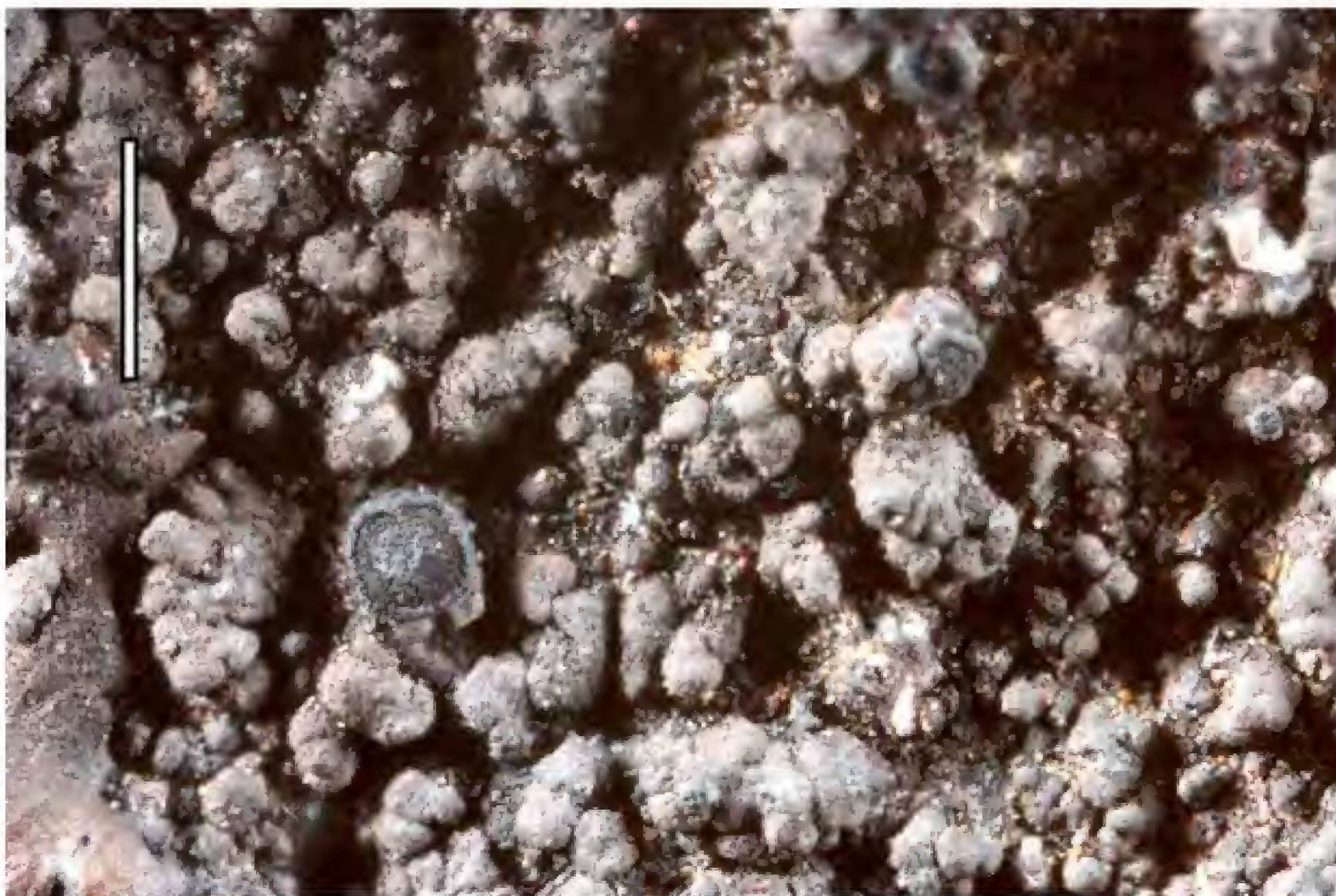
Fig. 2. Monerolechia glomerulans (Elix 41083 in CANB). Scale: = 1 mm

Like other species of Monerolechia , M. glomerulans is closely associated with or initially parasitic on various Xanthoparmelia species. It is characterized by the olive-brown to olive-black, bullate to squamulose thalli, black lecideine apothecia, small, Buellia -type ascospores, 10–15 µm long, 5–8 µm wide, and bacilliform conidia, 4–6 µm long, 1–1.5 µm wide. However, the most characteristic feature of this species is the morphology of the thallus where the bullate areoles or convex squamules become clustered closely together and agglomerated to form weakly elevated, broccoli-like heads (or glomerules). With age these glomerules may become markedly elevated or stalked (to 3 mm high) and isidia-like. Since more specimens of this rare species are now available an amended description follows.